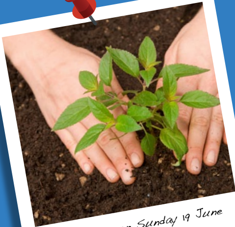
Tree planting on Sunday 19 June

Thank you to all of our staff and members who volunteered on the day. We look forward to working together with Greening Australia on future projects.