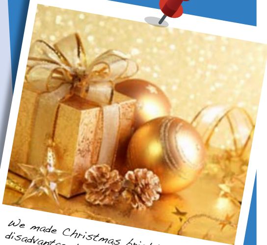
We made Christmas brighter for 1,700 disadvantaged people in the community.

Thank you to all members who donated gifts for this wonderful event for those less fortunate.